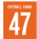
TABLE CODE: KC